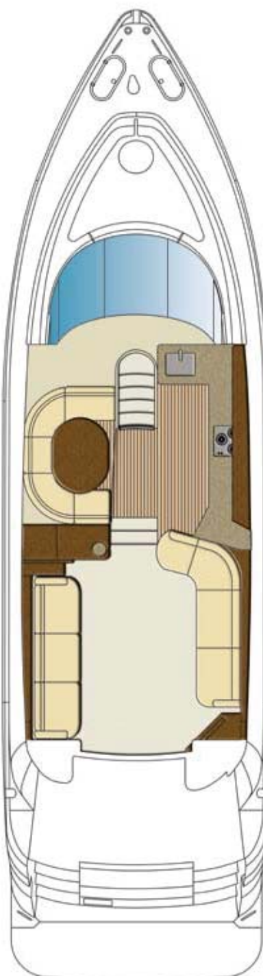
— OPEN CONCEPT GALLEY —